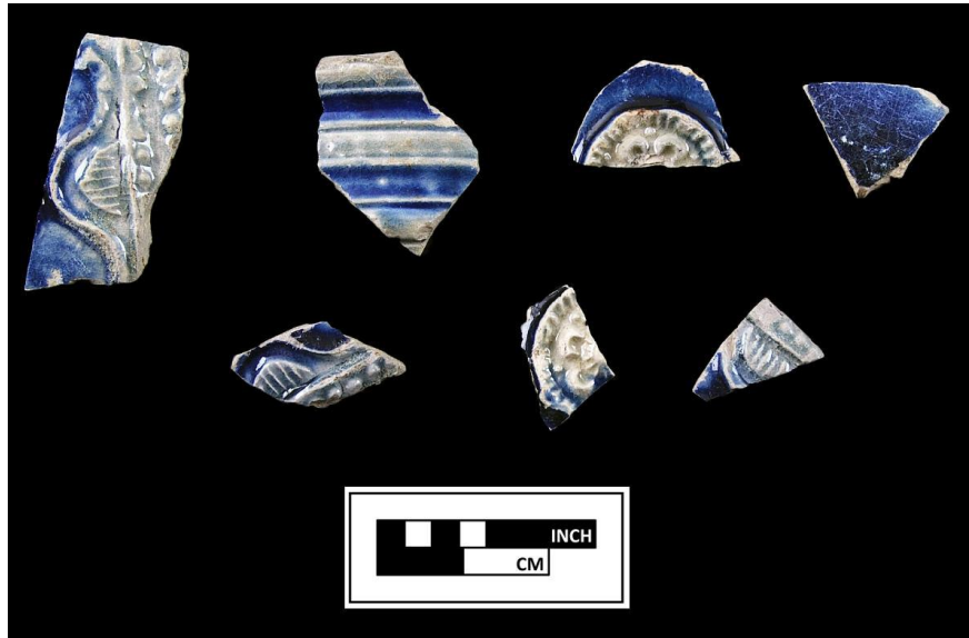
Figure 1: Rhenish blue and gray stoneware fragments recovered from the Clifton Site from Julia A. King's presentation to HPC, "In Search of Thomas Gerard"