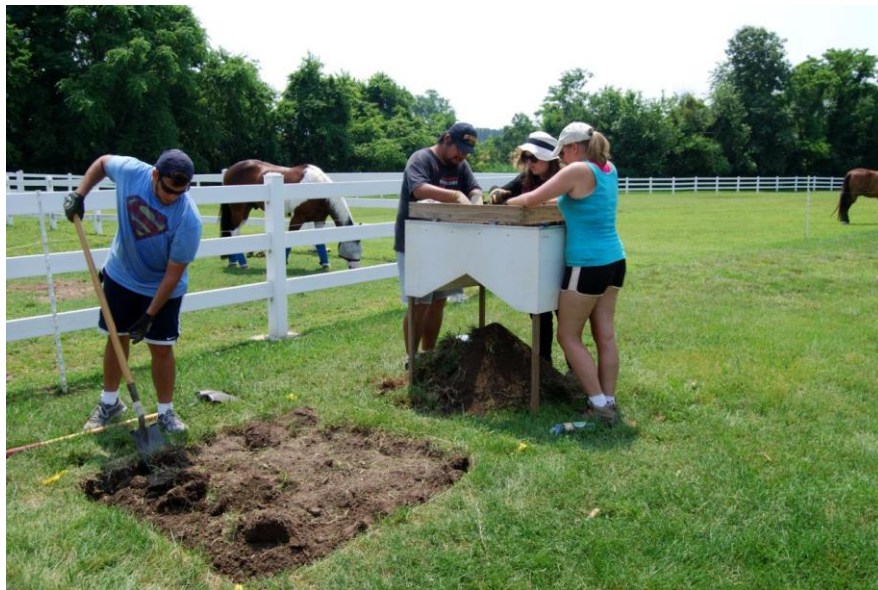
Figure 2: Excavating Unit 495400 at the Clifton Site from Julia A. King's presentation to HPC, "In Search of Thomas Gerard"