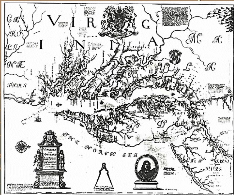
Figure 1: Augustine Herrman's 1673 Map from Craig Lukezic's presentation: Archaeological Excavations at Ft. Casimir